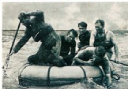
Cry of pain and triumph: Charles Frend's 'The Cruel Sea'

film-making. Which is why it is Spiegel's film rather than Lean's.